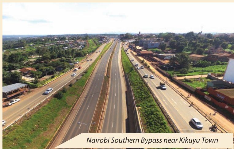
Nairobi Southern Bypass near Kikuyu Town