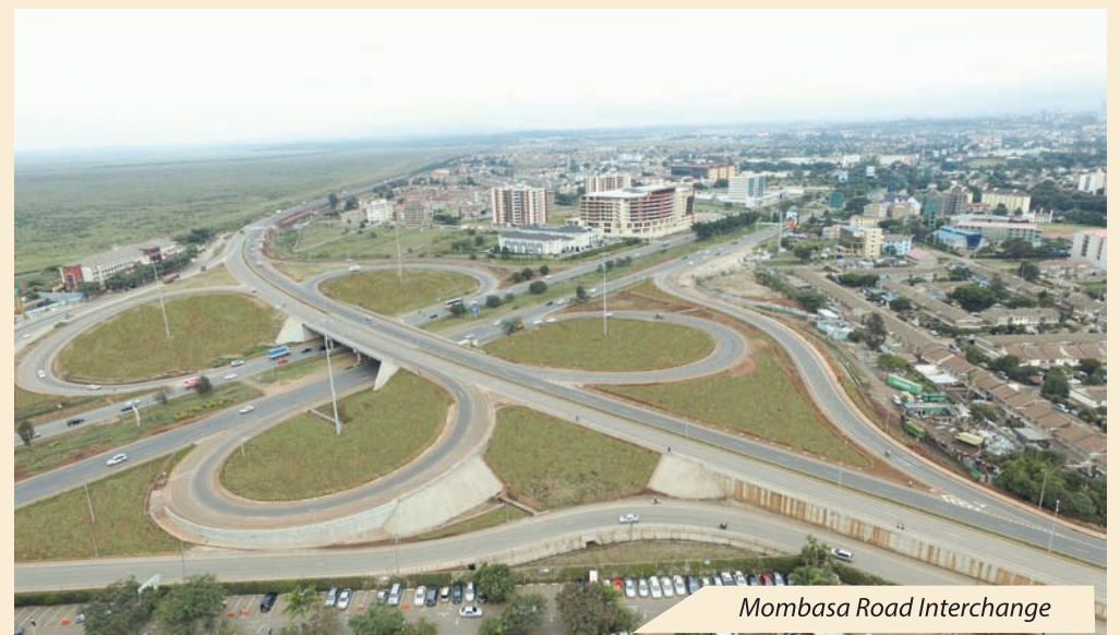
Mombasa Road Interchange

The Nairobi Southern Bypass is part of the ring road around Nairobi which links the Northern, Eastern and the upcoming Western Bypass that will complete the Ring Roads around the City of Nairobi.